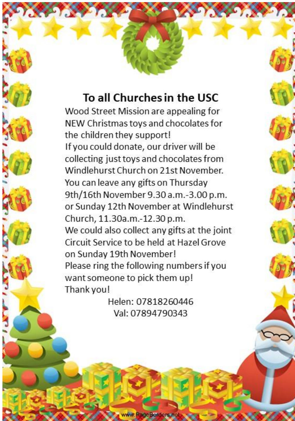
Photo Windlehurst is collecting toys and chocolates for the Wood Street Mission appeal to be collected by their driver on 21 st November. You can leave gifts on the following dates between 9.30 and 3pm 9 th and 16 th November or Sunday 12 th between 11.30 and 12.30. Also, at the joint service on Sunday 19 th at Hazel Grove