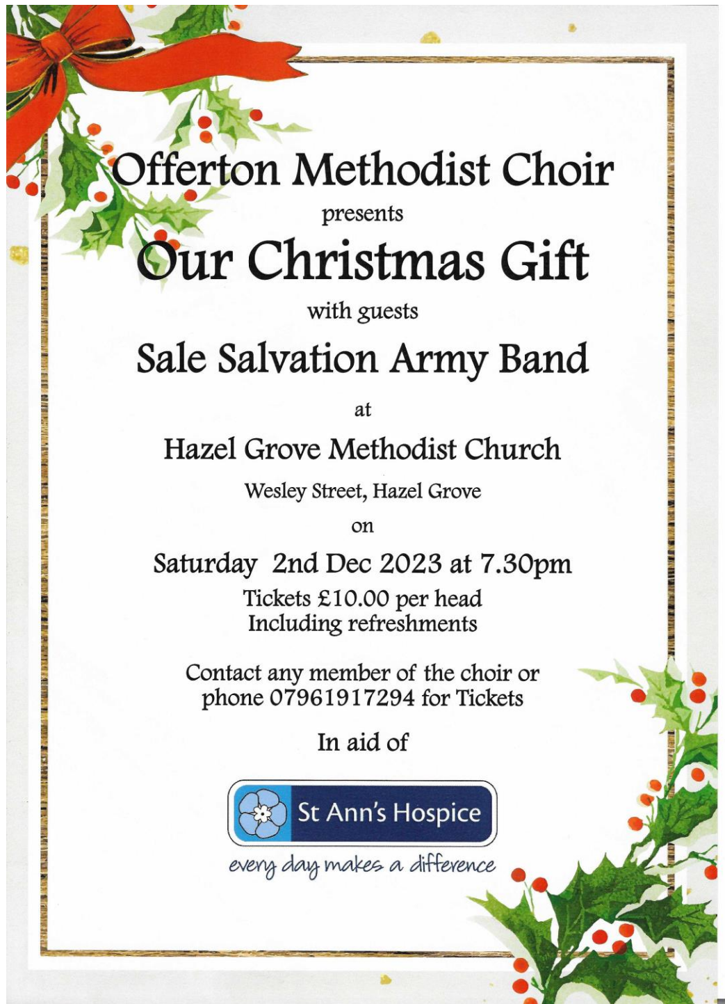
Photo Hazel Grove Methodist Church Saturday 2 nd December at 7.30 pm Tickets £10 with refreshments. Sale Salvation Army Band and Offerton Methodist Choir. 07961 917294 for tickets. The event is in aid of St Ann's Hospice.