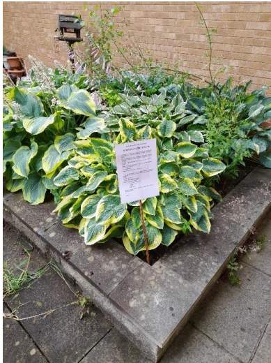
Photo. A letter from our Syrian Guests.